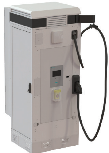
Cabinet model with cable management