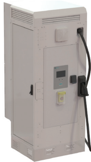
Cabinet model without cable management