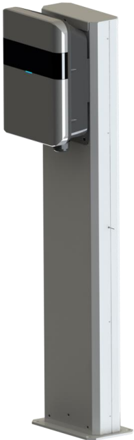
Charger not included