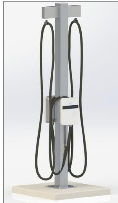
Chargers not included