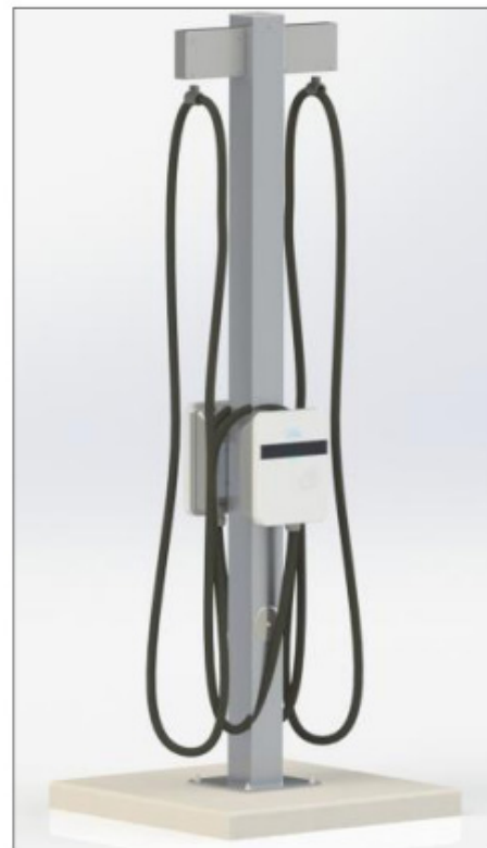
Chargers not included

Document No.: DATA106 Last Updated: December 13, 2023 Supersedes: May 31, 2023